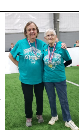
SWG 2nd Place Bocce Ball